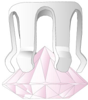
A1947 7mm Round