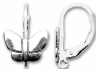
E2047 with split ring