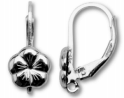
E2037 with split ring