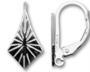
E2039 with split ring