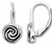
E2041 with split ring