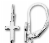
E2049 with split ring