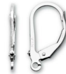
F0727 with split ring

APAC has developed a leverback which utilizes fusion technology to easily bond settings, motifs, and in some cases castings, to the face of the leverback without subjecting the parts to intense heat associated with conventional solder or brazing methods.