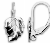
E2043 with split ring