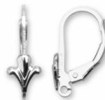
E2029 with split ring