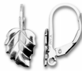
E2045 with split ring