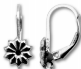
E2035 with split ring